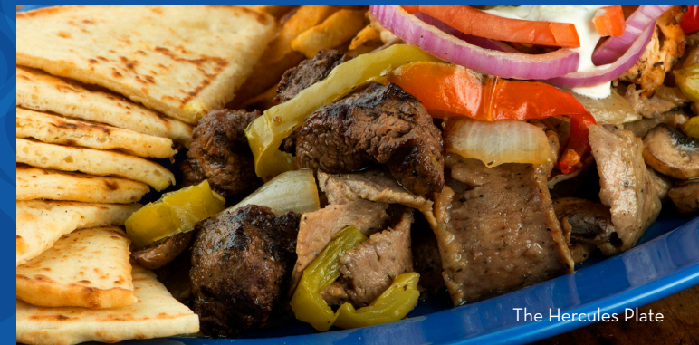
The Hercules Plate

Add hummus, homemade potato chips & cookie to any sandwich order 4.00