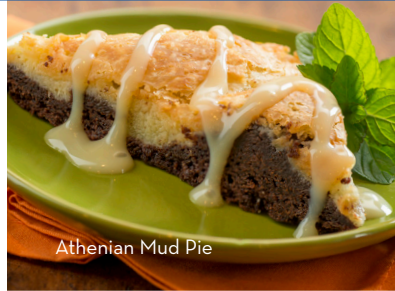
Athenian Mud Pie