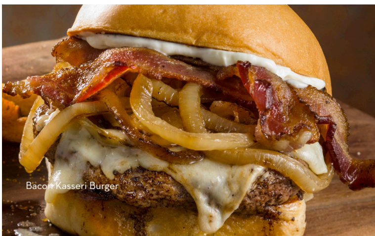
Bacon Kasseri Burger

Gyro slices, souvlaki & chicken kebob, tomato, cooked onions, bell peppers, mushrooms, tzatziki, yalandji dolma & two pitas. 20.40