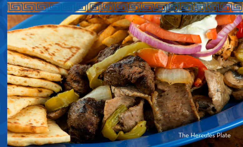
The Hercules Plate

Add hummus, homemade potato chips & cookie to any sandwich order 4.50