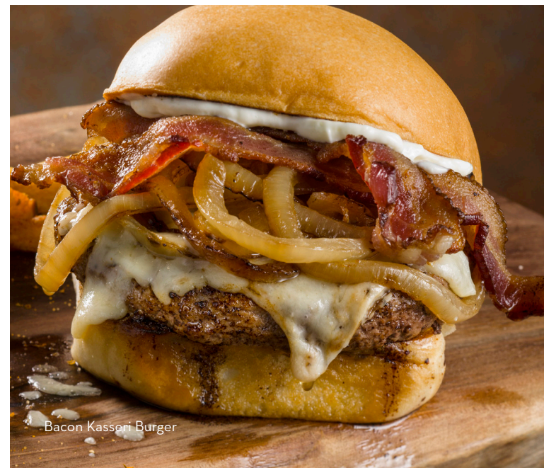
Bacon Kasserli Burger

BACON KASSERI BURGER* Applewood bacon, melted Greek kasseri cheese, caramelized onions, mayo. 12.70