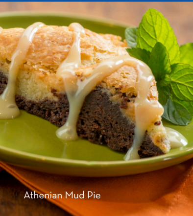
Athenian Mud Pie