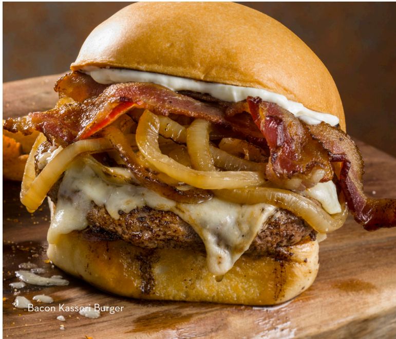
Bacon Kasseri Burger

BACON KASSERI BURGER* Applewood bacon, melted Greek kasseri cheese, caramelized onions, mayo. 15.70