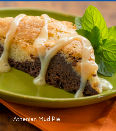
Athenian Mud Pie