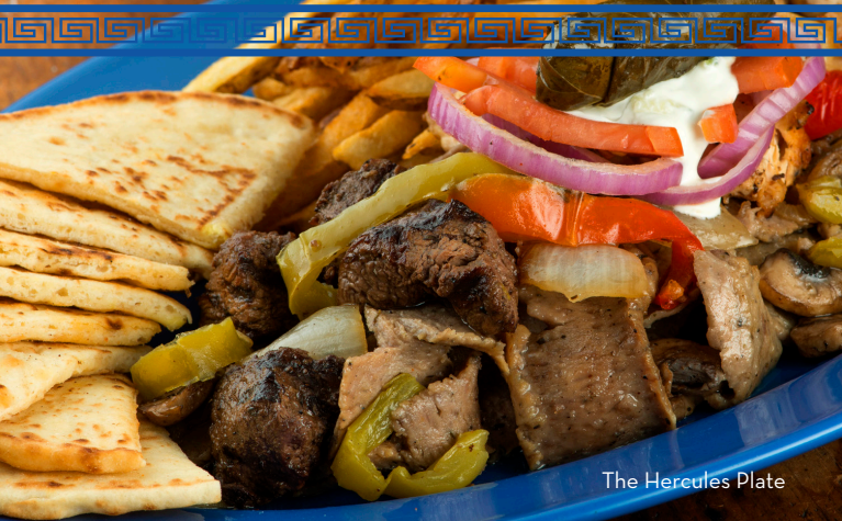
The Hercules Plate

BOX LUNCH UPGRADE Add hummus, housemade potato chips & cookie to any sandwich order 6.00 🍪