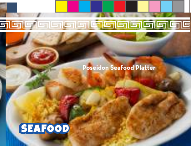
Poseidon Seafood Platter